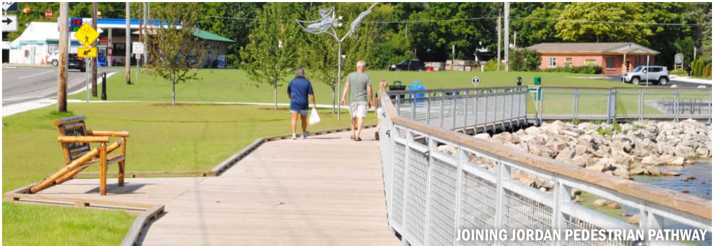
JOINING JORDAN PEDESTRIAN PATHWAY